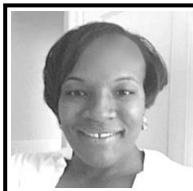
Ebony Holloway Reformed Episcopal Church of the Atonement Philadelphia, PA